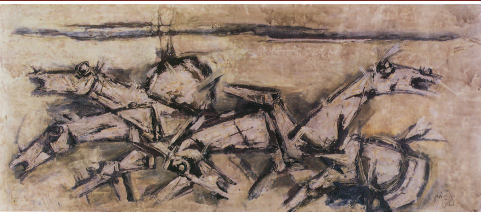
Image credit: M.F. Husain, Lightning Horses , ca. 1979, Oil on canvas, 43 x 100 inches Collection of Sri and Harsha Reddy. Exhibition display: Midnight to the Boom: Painting in India After Independence Peabody Essex Museum, February 2 - April 21, 2013