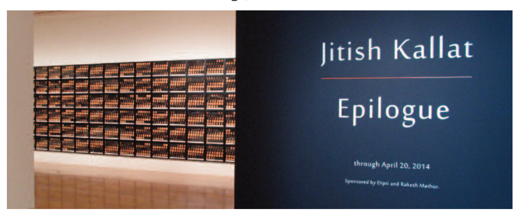
San Jose Museum installation, Epilogue

Kallat's works have been exhibited at numerous museum exhibition venues around the world. His works also reside in major collections including the National Gallery of Modern Art, Delhi, Art Institute of Chicago, Museum of Contemporary Art, Los Angeles, Singapore Art Museum, Fukuoka Asian Art Museum, Japan, SAATCHI Gallery, London, as well as in Belgium, Switzerland, Korea and Hong Kong, among others.