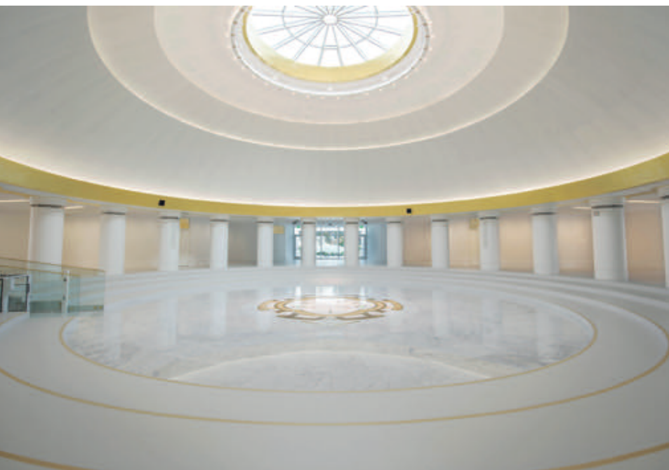
The Prayer Hall, Sufism Reoriented Sanctuary, Walnut Creek, California