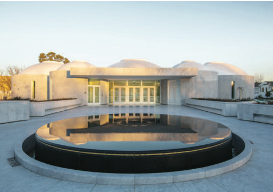
New Sufism Reoriented Sanctuary, Walnut Creek, California