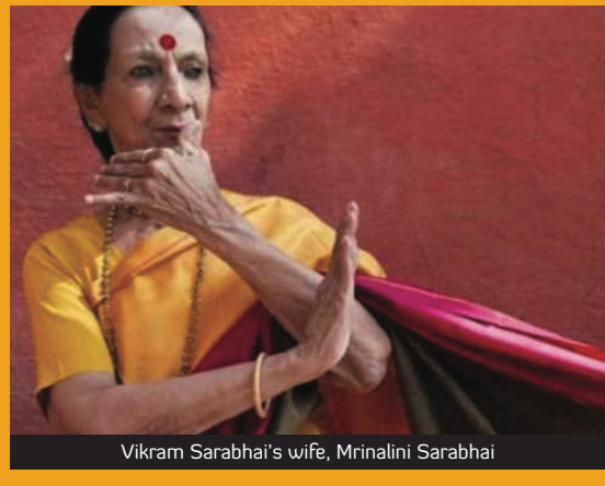
Vikram Sarabhai's wife, Mrinalini Sarabhai