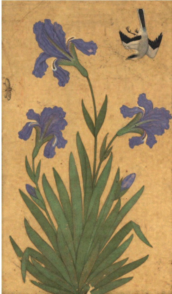
Image detail: Iris and Little Bird Ascribed to Ustad Mansur Mughal, c. 1618 Golestan Palace Library, Tehran, Iran

In an illustrated presentation, Dr. Asok Das will share images of some of the finest works of Ustad Mansur. He will shed light on the subject of Mughal painting from the imperial studios of Akbar and Jahangir with special reference to the genre of nature in art.