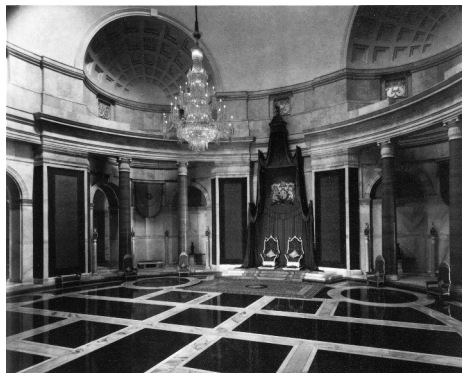
The Durbar Hall in the Viceroy's House, completed 1929, by Sir Edwin Lutyens, New Delhi

Madras and Calcutta, second city of the British Empire, and the "City of Palaces";