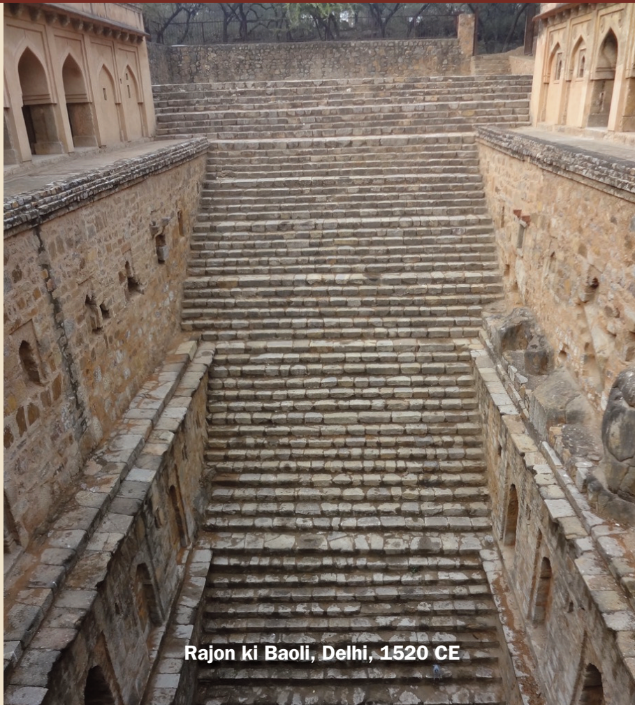
Rajon ki Baoli, Delhi, 1520 CE

Stepwells are subterranean edifices unique to the subcontinent, first constructed around the 6th century CE and continuing for over a millennium. As marvels of architecture, engineering and art they are nearly unsurpassed, often enormous in scale and with extraordinary ornamentation, commissioned by both Hindus and Muslims alike. Unlike other historic monuments they performed several vital functions, the most important of which was to provide water year-round, even when it was ten stories deep. Long flights of stairs accessed the bottom most level in dry seasons, while during monsoons the often-ornate structures could fill to the top. Stepwells were also civic centers, spiritual destinations, cool retreats in brutal heat, and essential oases for remote caravans. Thousands once existed throughout the country, but most have disappeared – and continue to – from lack of use and interest. Preserving these unknown wonders requires an international effort.