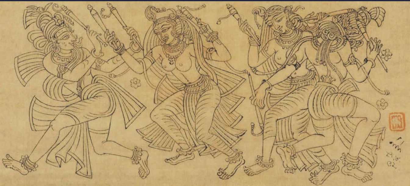
Nandalal Bose - Dandia Dance