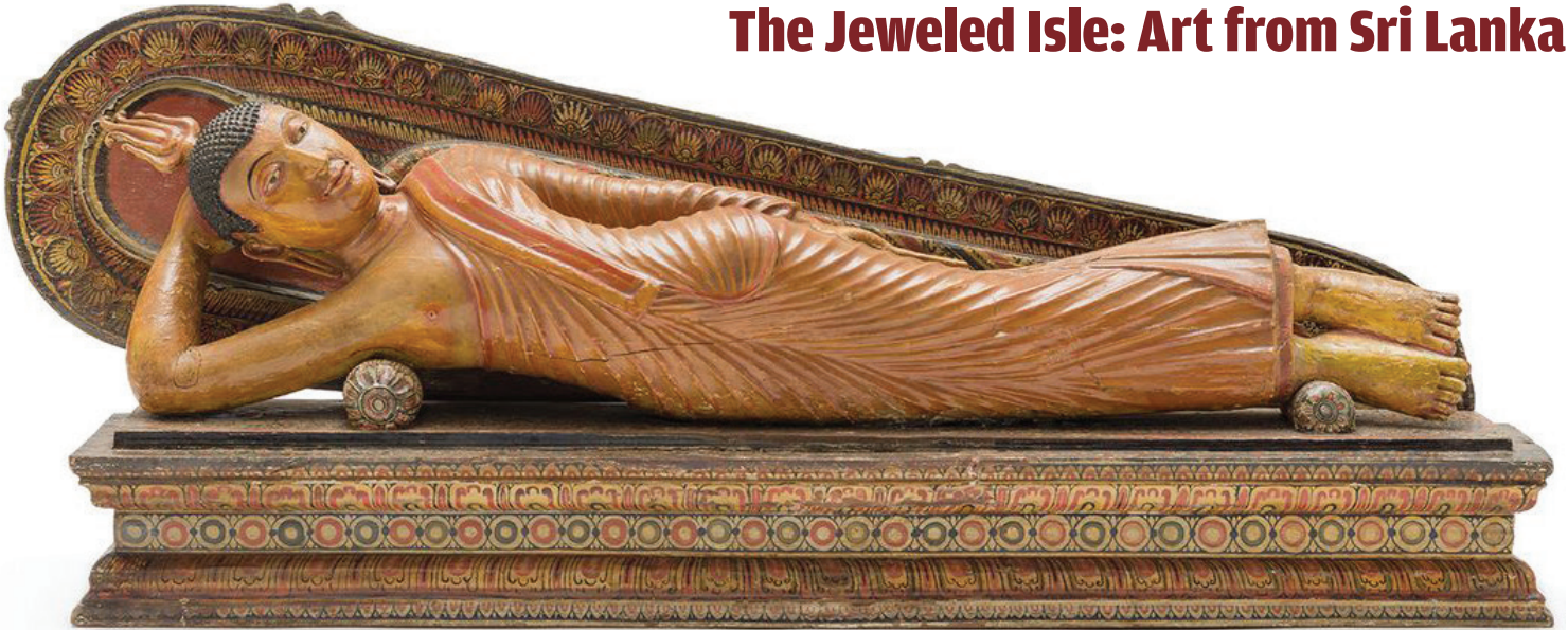
Buddha Reclining , 18th century, Sri Lanka, wood with paint, 14 1/2 x 37 3/4 x 6 5/8 in., Los Angeles County Museum of Art, Purchased with funds provided by Anna Bing Arnold, photo © Museum Associates/LACMA