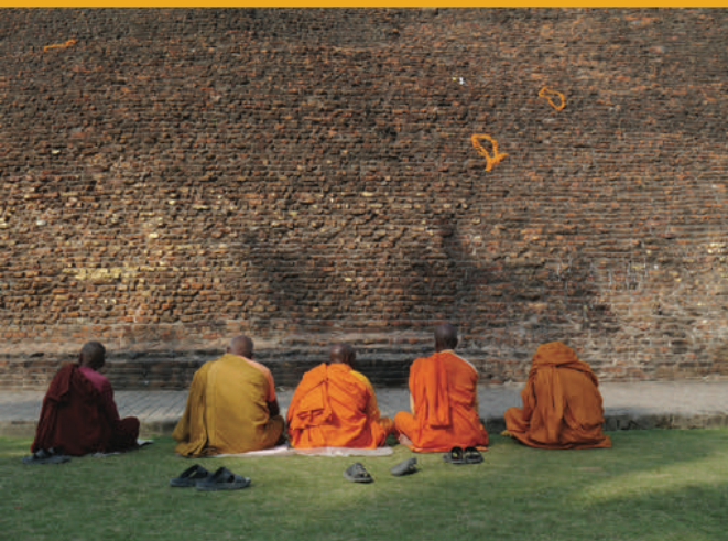
Ramabhar Stupa, Kushinagar, India.

RSVP: info@sachi.org TEL: 650-400-3696 Limited Seating