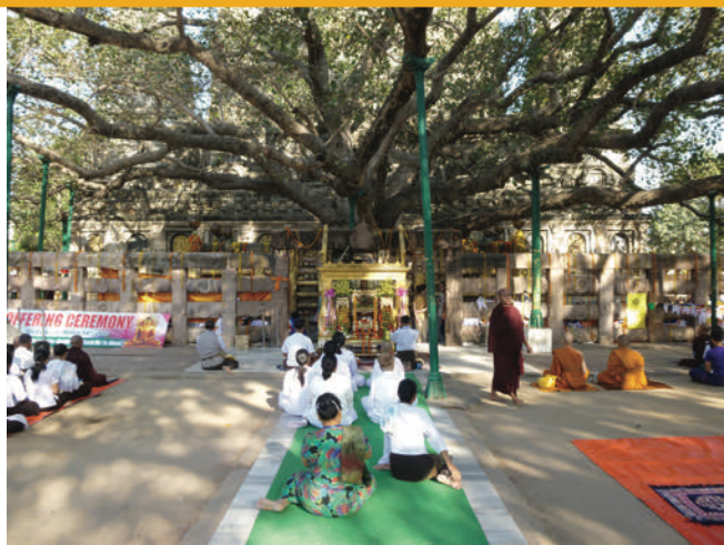
Under the Bodhi Tree, Bodh Gaya, India.