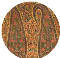
Kashmir shawl, c. 1860, pieced, kani woven