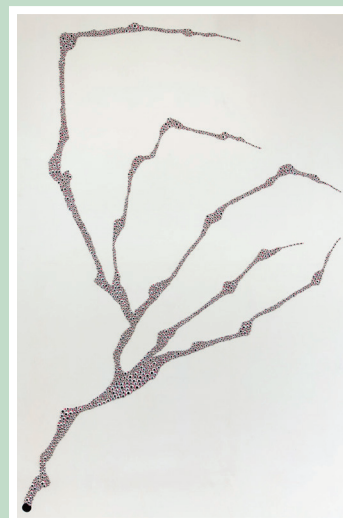
Anita Dube, River Disease (version 2) , 2010 Enamel votive eyes | 8 feet x 8 feet x 6 feet

Indian Contemporary Art holds a distinct space in the global art scene. The Indian artist is not only drawn to the nation's rich historical traditions of art, craft, and modernism, but their remarkable engagement with material allows them to interweave politics, culture, and religion into their work. In Arshiya Lokhandwala's talk, she will unpack these complex, multi-layered artistic practices, discussing the works of contemporary artists such as Shilpa Gupta, Anita Dube, Subodh Gupta, Bharti Kher, Jitish Kallat, Mithu Sen, across various mediums including new media, concluding with the role of art and technology with her recent exhibition The Future is Here: Art and Technology in a Millennium Age .