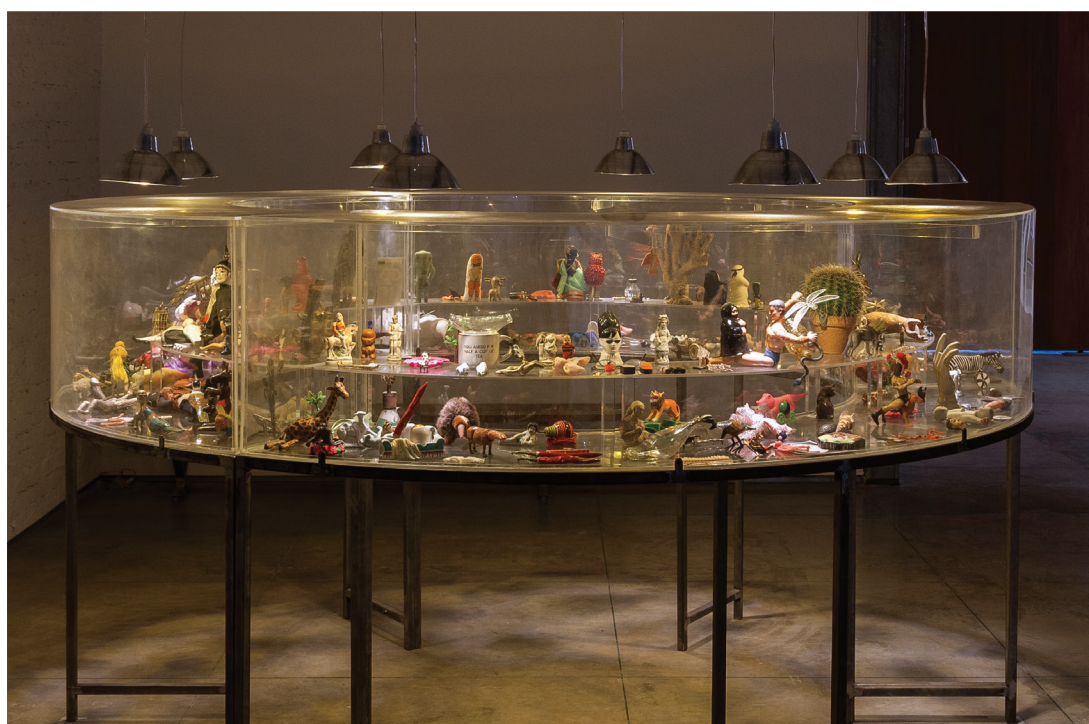
Mithu Sen, MOU (Museum of Unbelonging), 2011 | Found objects, vitrine

SACHI, Society for Art & Cultural Heritage of India is excited to present the dynamic landscape of Art in Contemporary India with Dr. Arshiya Lokhandwala