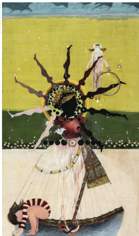
Cholee Kay Peechay Kiya? Chunree Kay Neechay Kiya? (What Is under the Blouse? What Is under the Dress?), 1997 Vegetable color, dry pigment, watercolor, and tea on wasli paper 24 x 13.1 cm (9 7/16 x 5 3/16 inches)