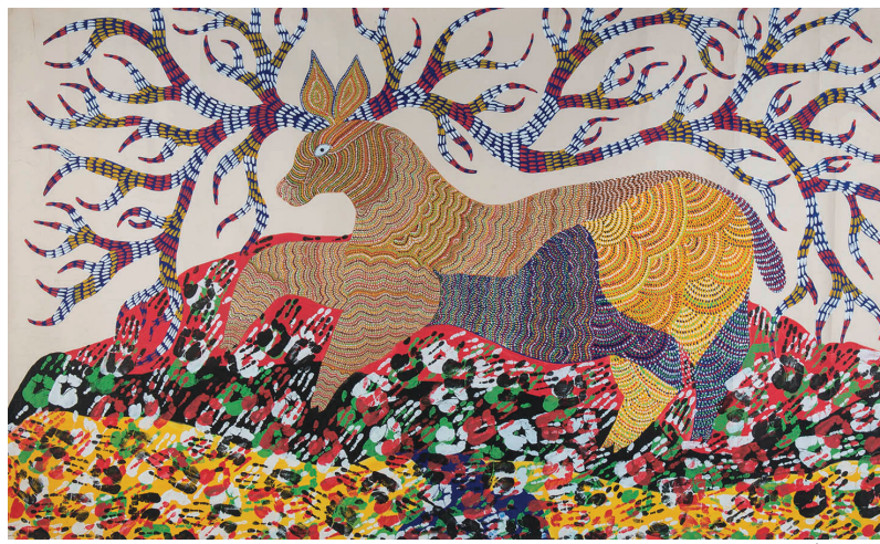
Portrait of a Barasingha (Antelope) | Jangarh Singh Shyam | mid 1980s | Madhya Pradesh, India | Pigment on paper | Image: H. 137 cm, W. 233 cm | PTG.00061

The conversation, in Q&A narrative form, will be appropriately illustrated with works from the MAP collection.