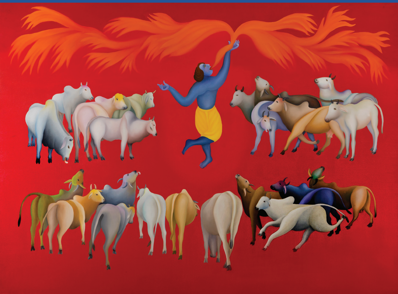
Krishna eating the Fire | Manjit Bawa | c.1980 | India | Oil on canvas | Image: H. 180.5 cm, W. 246.5 cm | MAC.00480

is Pleased to Offer a Special Conversation on the Origin and Evolution of a Museum for the 21st Century in Bengaluru, India.