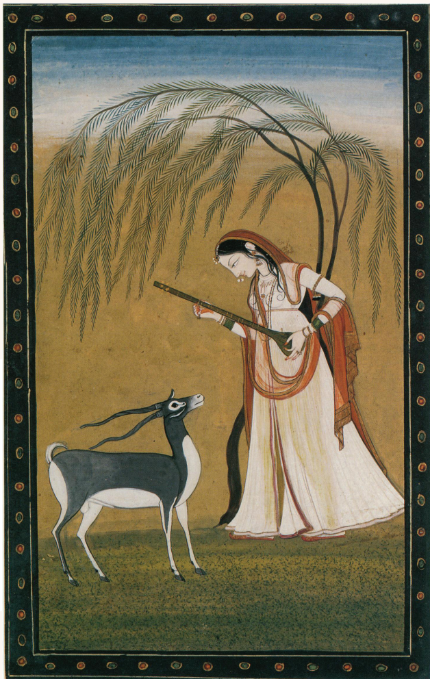
The Musical Mode: 'Ragini Todi', Ascribed to a Master of the Second Generation after Nainsukh, circa 1825-30. Government Museum and Art Gallery, Chandigarh 907, India This artwork is in the Public Domain in the US